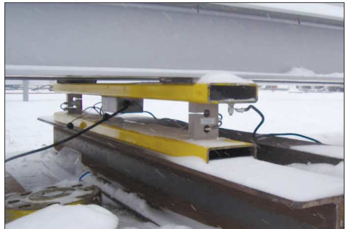
One beam pair supporting the desanding unit.