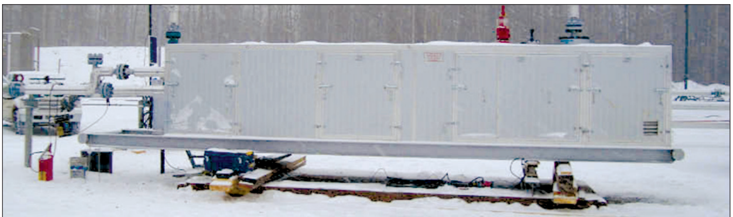
Desanding unit after installation on the load cell beam pairs.

For Sales and Service, Call TOLL FREE 1-888-82-66342® 1-888-TC-OMEGA